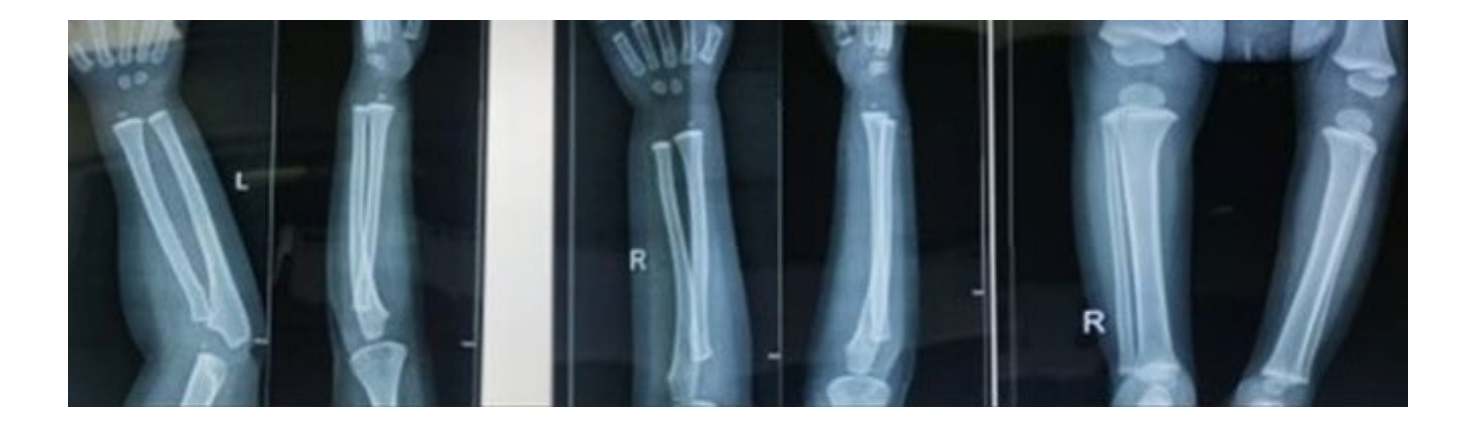
Figure 1: X-ray of long bones showing dense metaphysis suggestive of lead lines.

On Day 8 of admission, the repeat blood lead levels were 80 mcg/dL (Figure 2); hence, a plan was made to start IV chelation therapy. The child's anemia was treated by transfusing packed red blood cells. The pre-chelation work-up included complete blood counts; serum electrolytes,