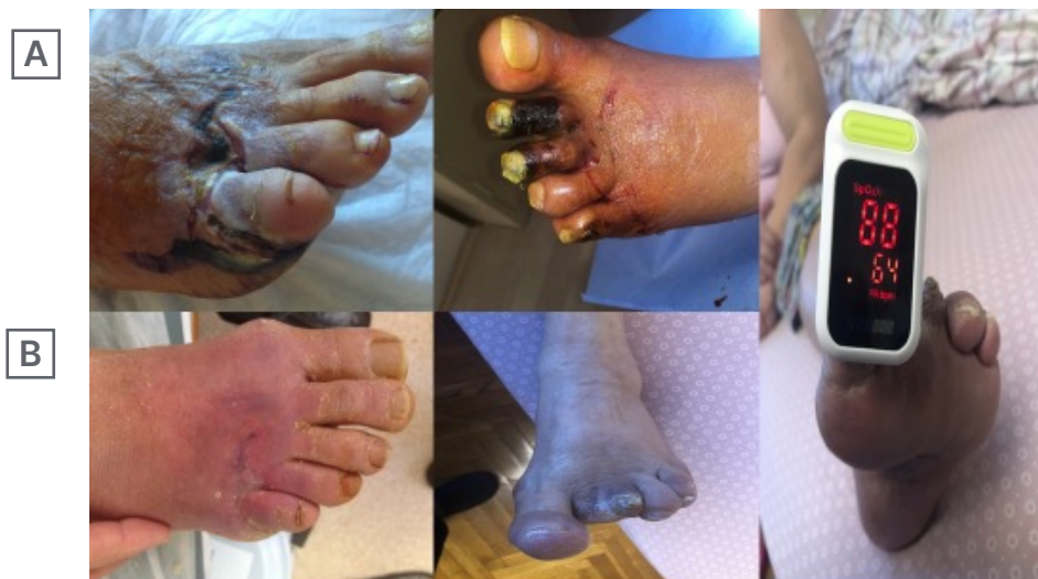
A) Pre-treatment and B) post-treatment with measurable oxygen saturation (which was impossible at the beginning).

epithelialisation, in a 3-week period, 46 patients showed a return to normal levels of CRP and the rest of the cases remained above the normal levels of CRP. In these cases, Hba1c levels did not alter more than 10% and autologous wound coverages were not more than 20% of the wound surfaces (Table 1). The dimensions of the wounds were calculated by milimetric paper measurement as a classic parameter in