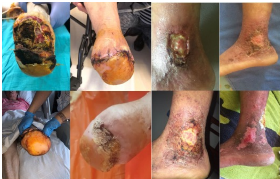
Figure 3: These two cases were resistant to treatment in the first 8 weeks because of pre-existing smoking, and continuing another 4 weeks resulted in healing.

Cessation of smoking gives better results following reduction of blood nicotine levels to normal.