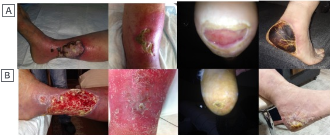
Figure 2: These cases had very high levels of HbA1c (such as 10.9) and after only 15 days of treatment (including amputation of necrotic parts), the ulcers were completely epithelialised and survived against high levels of HbA1c for 4 years.